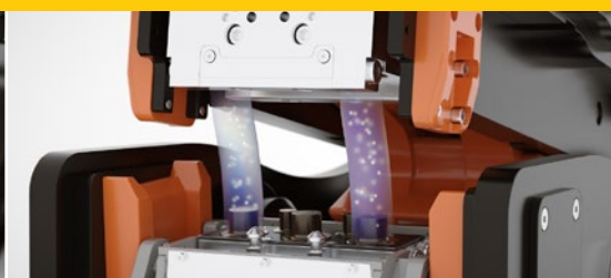
OIL FLOW UP TO 420 LITERS PER MIN