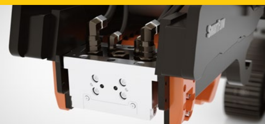
UNIVERSAL VALVE BANK

Fitted standard to the world-leading D-Lock coupler, the SmartFlow automatically connects up to 5 hydraulic lines without exiting the cab, and has industry leading oil flow of up to 420 liters per minute. Designed to work with OEM attachments, the pin-to-pin coupler system features a dirt protection guard which automatically closes once an attachment is released, significantly reducing contamination and risk of damage. SmartFlow houses an independent locking system, and encourages operators to change implements providing increased time savings and a quick payback on investment.