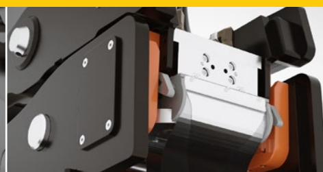
DIRT PROTECTION GUARD

SMARTFLOW IS AVAILABLE ON THE D-LOCK COUPLER, THE D-LOCK TILT COUPLER, ALL MAJOR COUPLING SYSTEMS, AND WITH THE NOX TILTROTATOR.